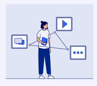
For the young generation, meeting setting does not have a lot of effect on experience.